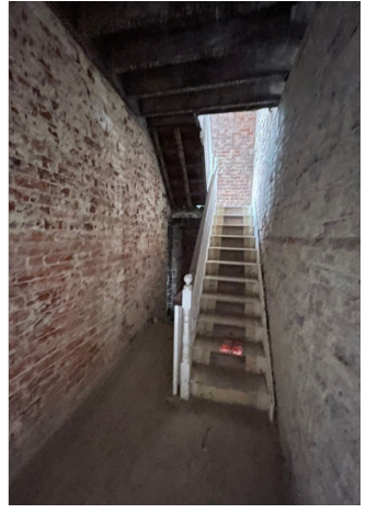
The selling agent, Savill's, has strong interest in the properties already as we near a soft launch to a select database of potential buyers. The developer will be looking to secure off plan sales of both units before Christmas.