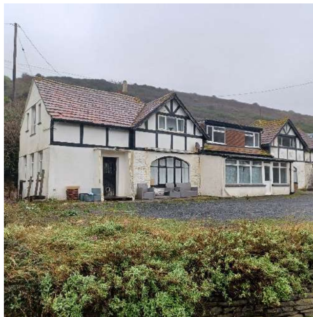
Terrace of three cottages